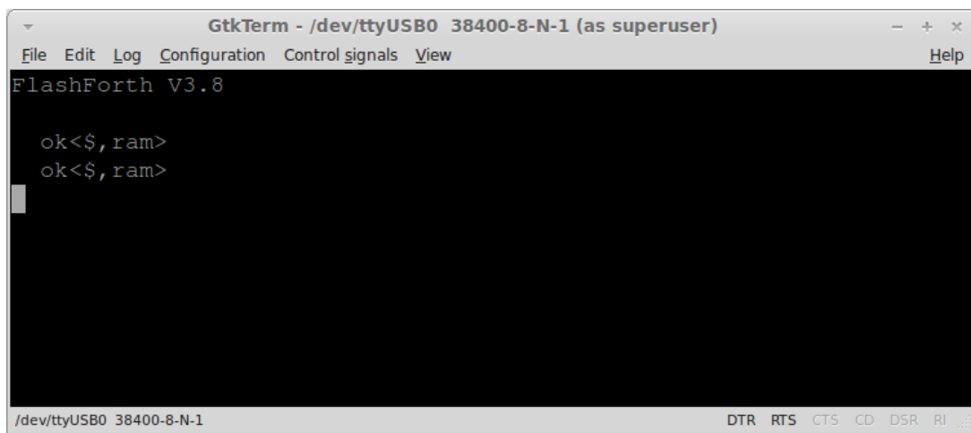
Figure 1: Opening screen using gkterm .

Pressing the ENTER ↵ key a couple of times should get the display as shown in Figure 1. The ok<$,ram> prompt indicates that the current base for representing numbers in hexadecimal format and that the current context for making variables is static RAM, rather than the Flash memory and EEPROM that is also available in the microcontroller.